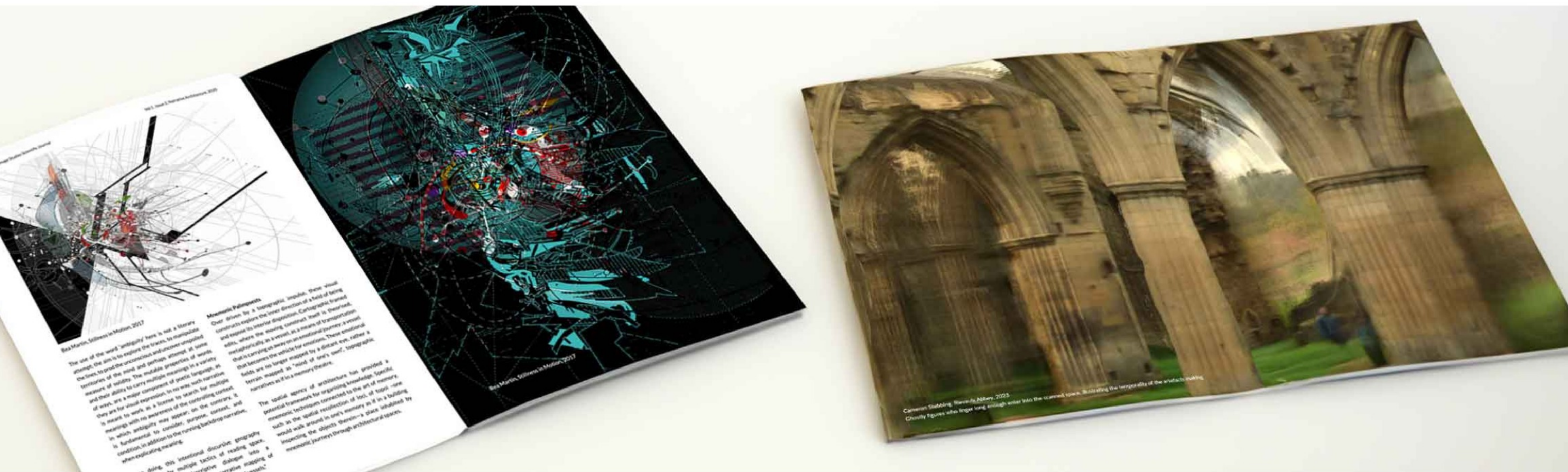
Image from 2020 and 2025 publications, examples of our full-bleed, double-spread layout. Cover Image from goINDIGO 2022 publication.